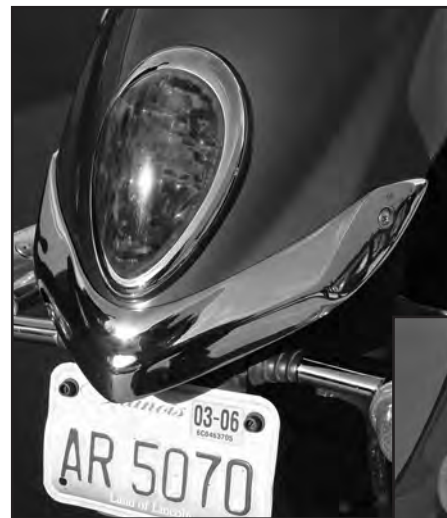
Finished Installation Rocket