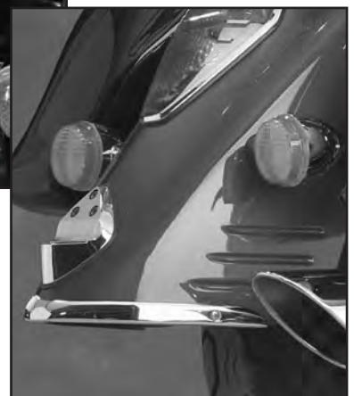
Finished Installation VTX