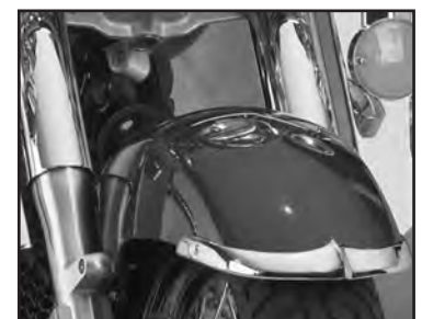
Finished Installation VTX