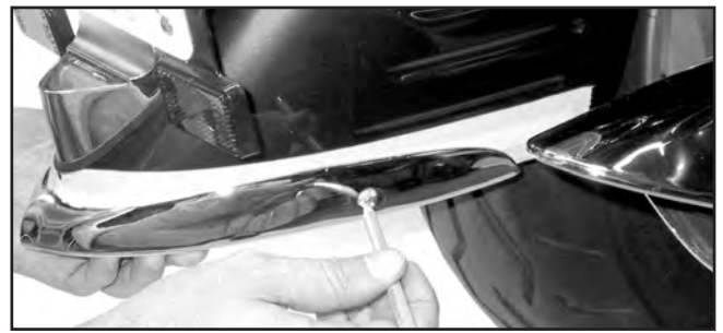
Figure 1. Tape Fender, Position Fender Tip, Mark Fender

Clean and polish with a chrome cleaner/polish. Check tightness of the nuts regularly.