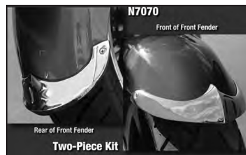
Finished Installation Rocket