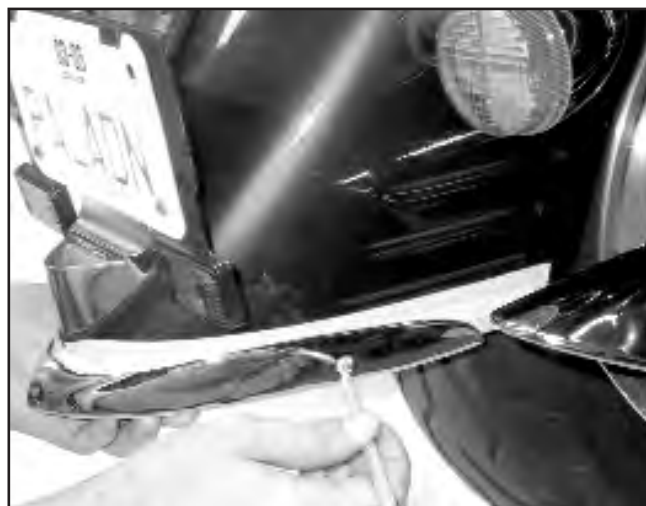
Figure 1. Tape Fender, Position Fender Tip, Mark Fender

Clean and polish with a chrome cleaner/polish. Check tightness of the nuts regularly.