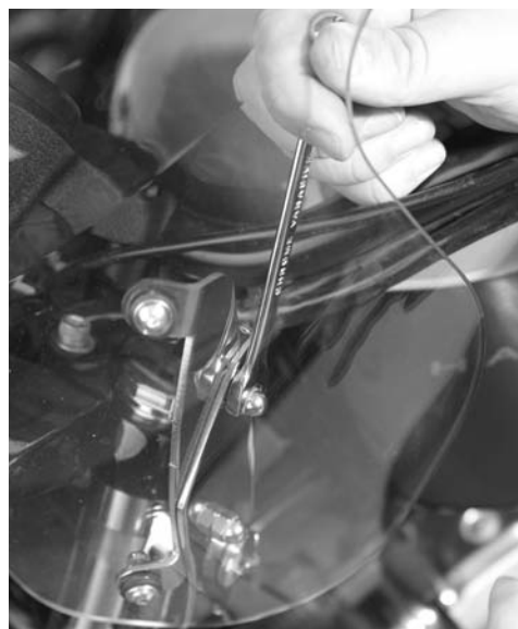
Figure 5 Photo, taken with clear shield on an XL