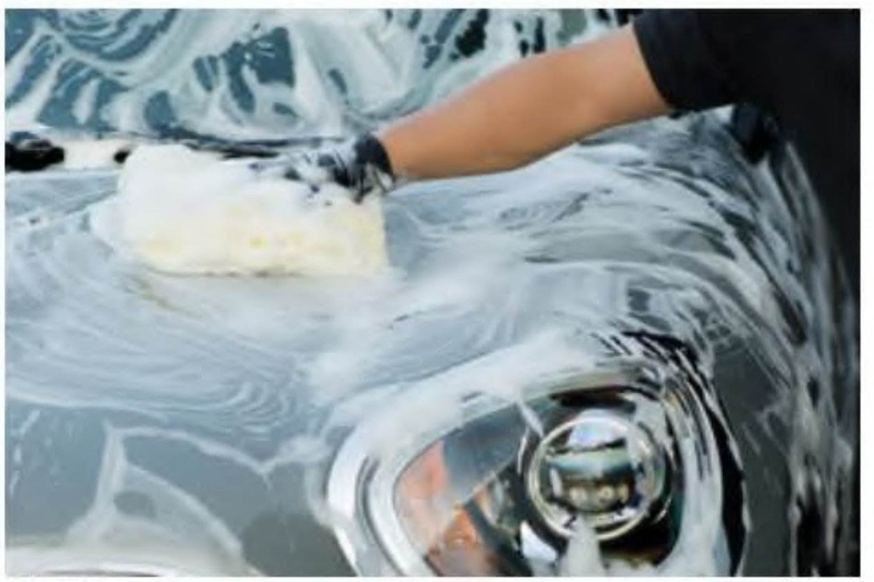
Step 3: Lather the surface with generous amount of soap.

Step 2: Fill bucket with water creating desired amount of suds.