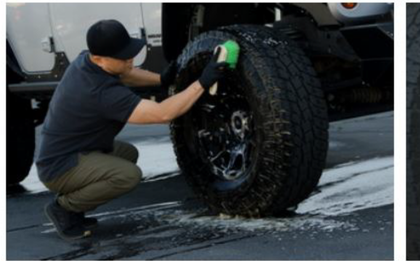
Step 1: Clean tire thoroughly free of dust, dirt, and previously applied tire dressing.