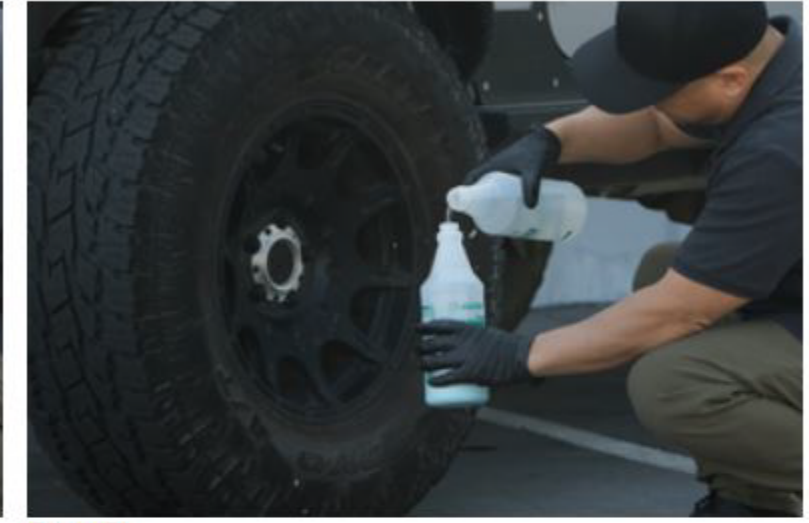
Step 3:Step 4:Add water to HYPER DRESS according to the desired<br/>mix ratio 1:1, 2:1, 3:1 or 4:1Step 4:Spray a generous amount of HYPER DRESS onto<br/>applicator pad.