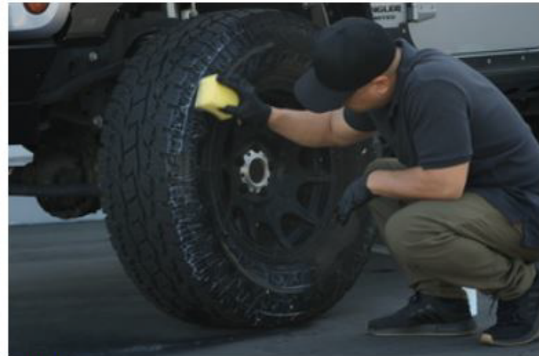
Step 6: Spread HYPER DRESS evenly over entire surface of tire face.

Shop for quality Nanoskin products on our website.