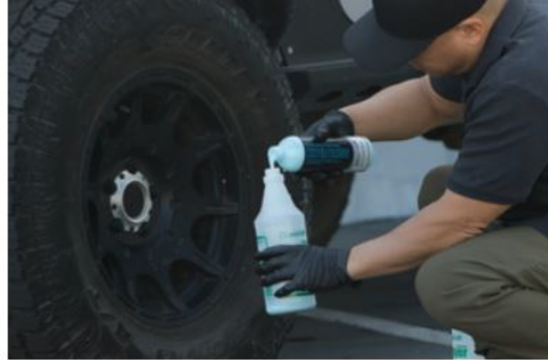
Step 2: Pour HYPER DRESS into sprayer bottle. HYPER DRESS can be mixed 1;1, 2:1, 3:1 or 4:1 with water depending on the level of gloss and sheen desired.