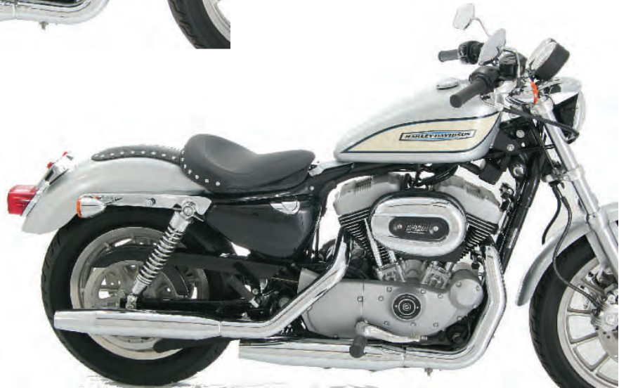
#76629 frame mounting plate on an '04 Sportster 3.3 gal. tank mounted in the rearmost seating position.