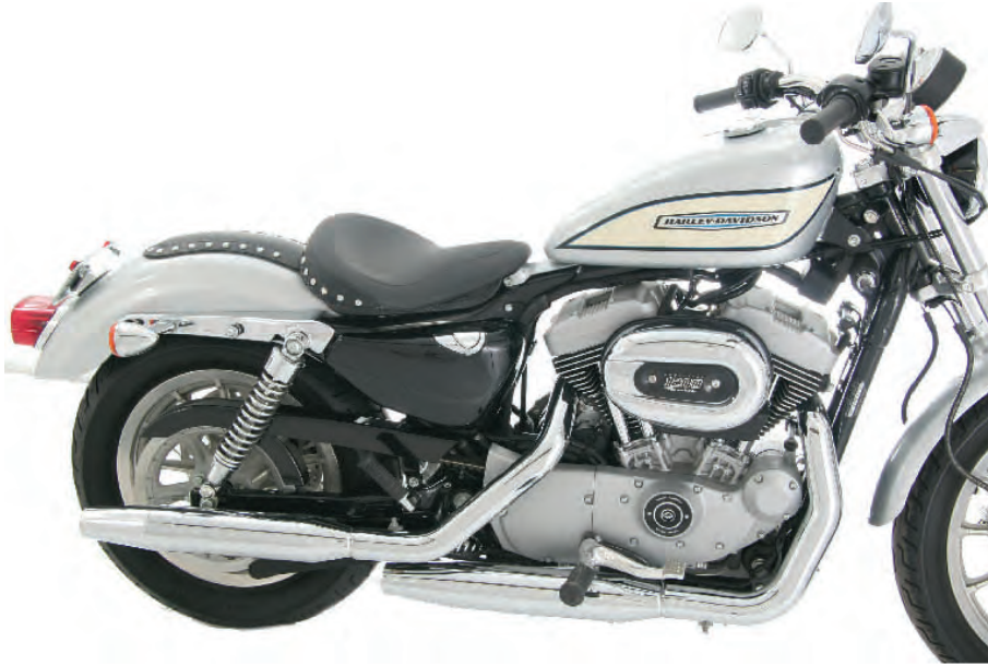
#76629 frame mounting plate on an '04 Sportster 3.3 gal. tank mounted in the forward seating position.