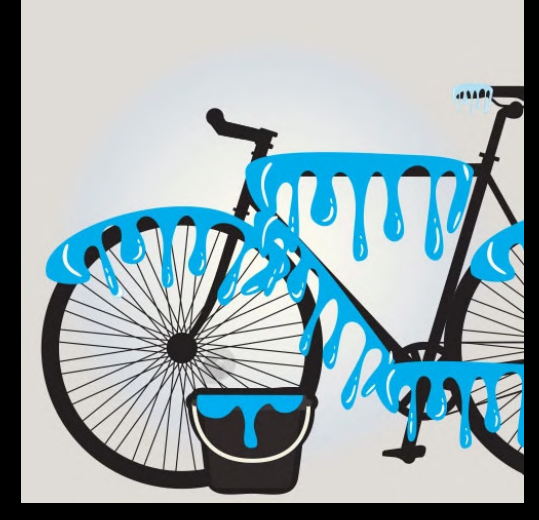
Pre-wet the bike.