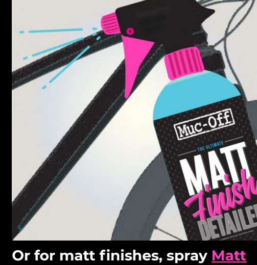
Finish Detailer to protect quickly detail your matt frame. Wipe off excess residue.