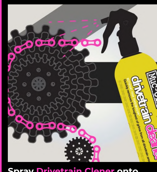
Spray <u>Drivetrain Clener</u> onto chain and cogs.