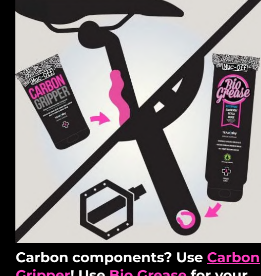
<u>Gripper:</u> Use <u>Bio Grease</u> bearings, moving parts and cables.