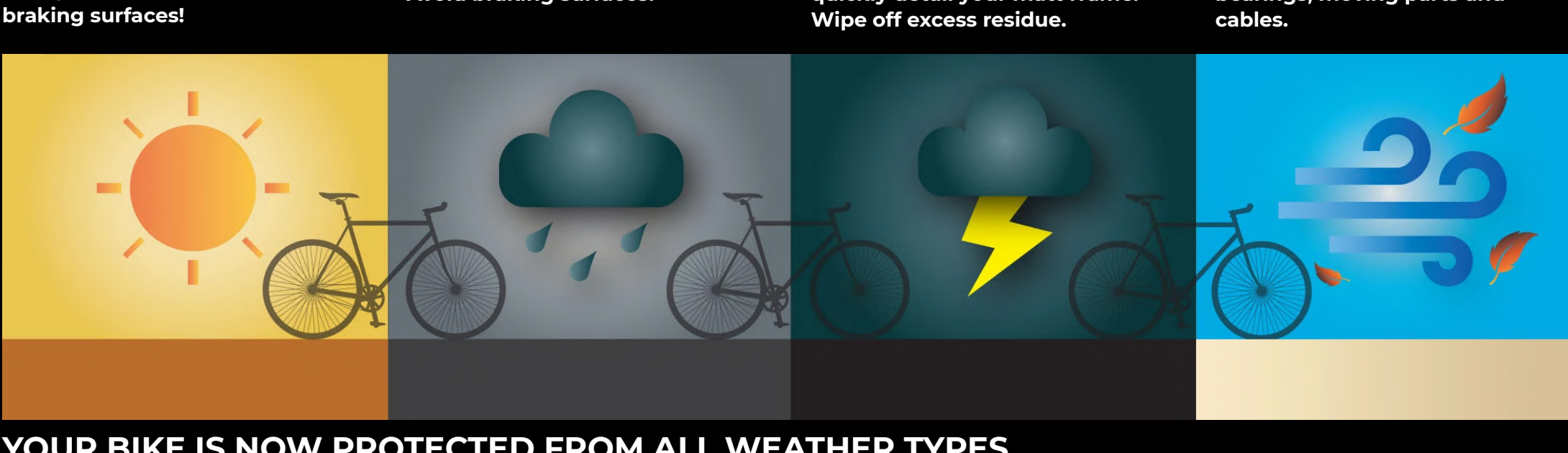
YOUR BIKE IS NOW PROTECTED FROM ALL WEATHER TYPES...