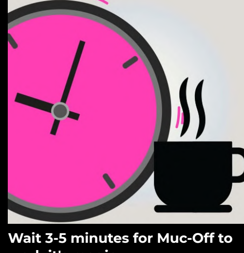
work it's magic.