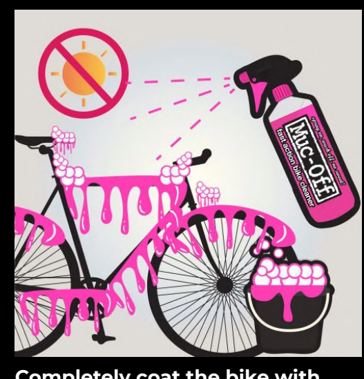
Completely coat the bike with Nano Tech Bike cleaner. Make sure the bike is out of direct sunlight.