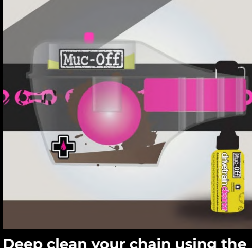
Deep clean your chain using the X-3 Dirty Chain Machine.