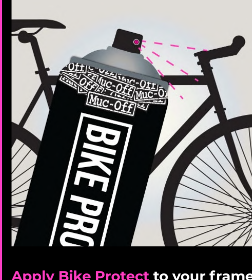
Bike Protect to your frame for a protective finish. Avoid