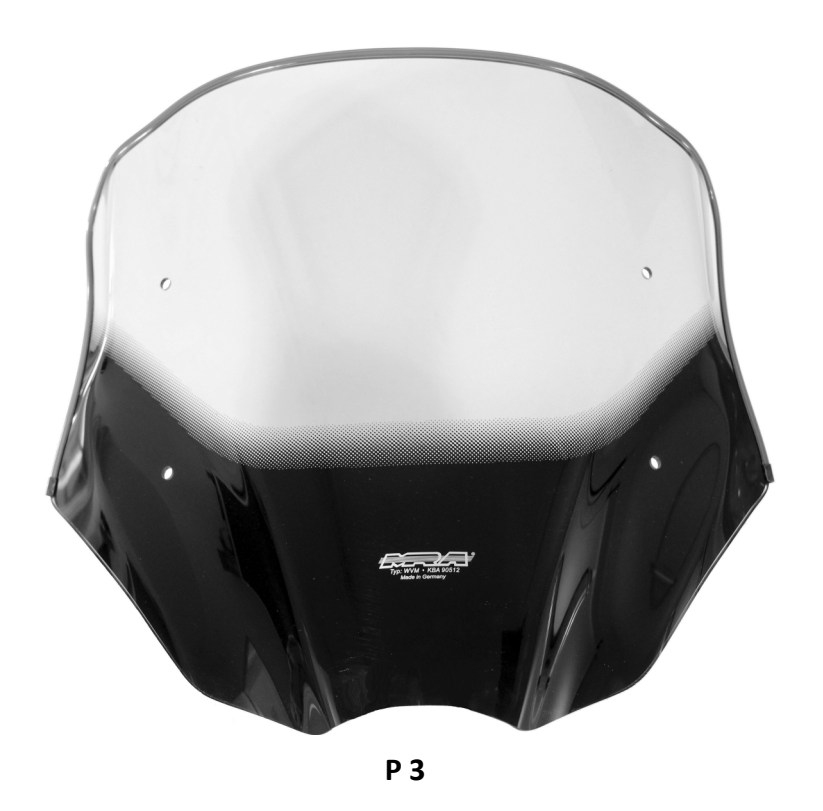
Functional Description Variotouringscreen VT

Thank you for purchasing a Variotouringscreen. Please carefully read these instructions. You will get the most out of the adjustable spoiler if you thoroughly understand its features.