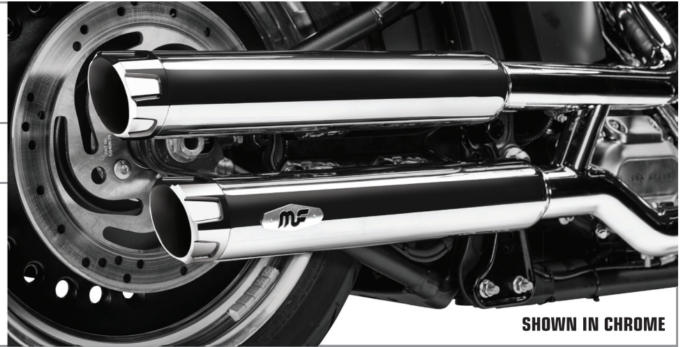
SHOWN IN CHROME