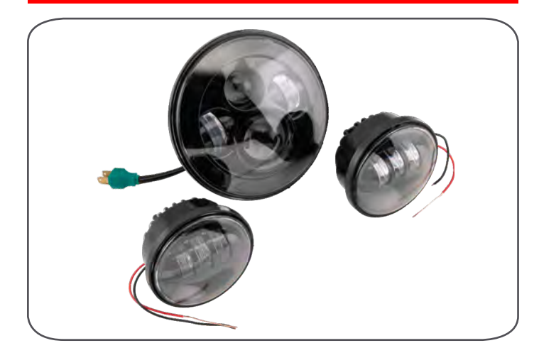
7" LED Black Lamp, Premium Headlamp w/ (2) 4.5" Black Fog/Passing Lamps, 100% Plug-n-Play, includes mounting adapter!