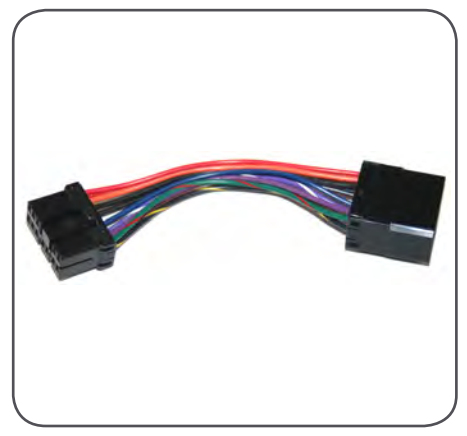
Passing Lamp Control Harness, 100% Plug-n-Play. (Allows the use of passing lamps while high beam is on.)