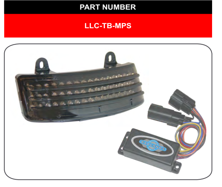
Tri-Bar Fender Tip LED Running Light, SMOKE LENS and Plug-n-Play, RUN-BRAKE-TURN Signal module with Load Equalizer, Fits: '10-'13 Street and Road Glide Models. Allows customer to use LED's for turn signals in front and rear with NO additional modules or modifications!