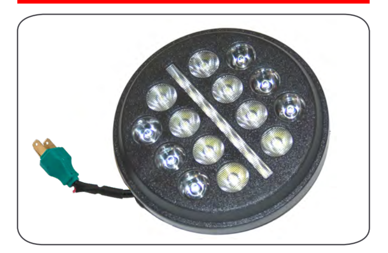
5.75" LED Black Buck-Shot Style mini-multi Headlamp, 100% Plugn-Play! (14-mini LED's with horizontal bar, 8-low beam and an additional 6 LED's lit for high beam)