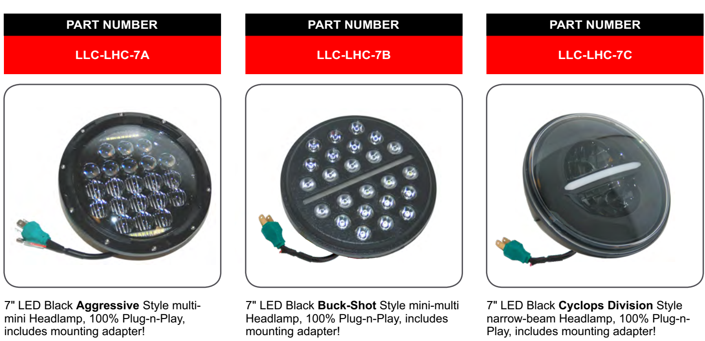
7" LED Black Buck-Shot Style mini-multi Headlamp, 100% Plug-n-Play, includes mounting adapter!