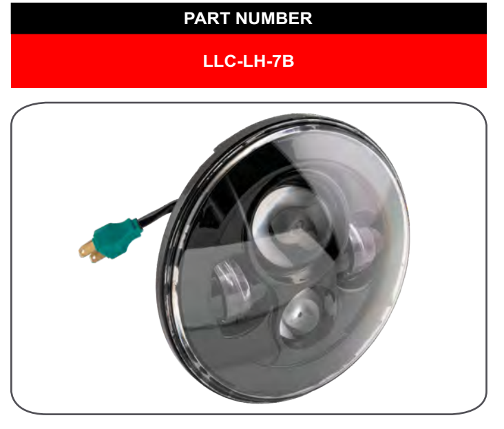
7" LED Black Premium Headlamp, 100% Plug-n-Play, includes mounting adapter!