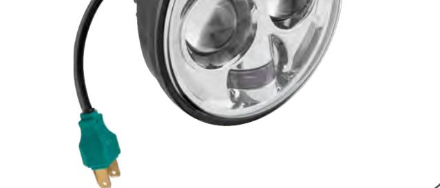
5.75" LED Chrome Premium Headlamp, 100% Plug-n-Play. (Fits most 5.75" headlight buckets)