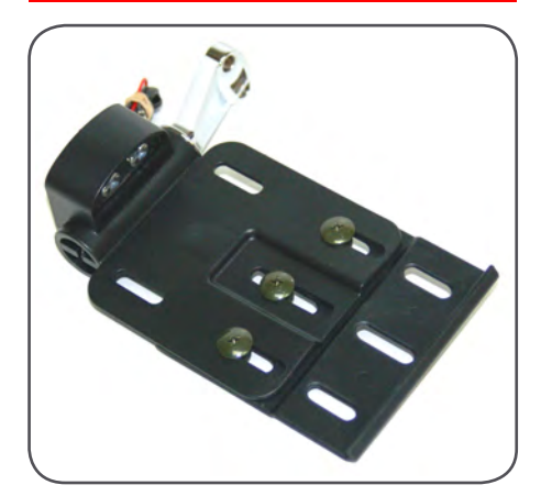
XL & Dyna Foldable Side Tag Mount with clear lens, LED License Plate Light, Fits: Sportster, Dyna Models & custom applications. (sold each)