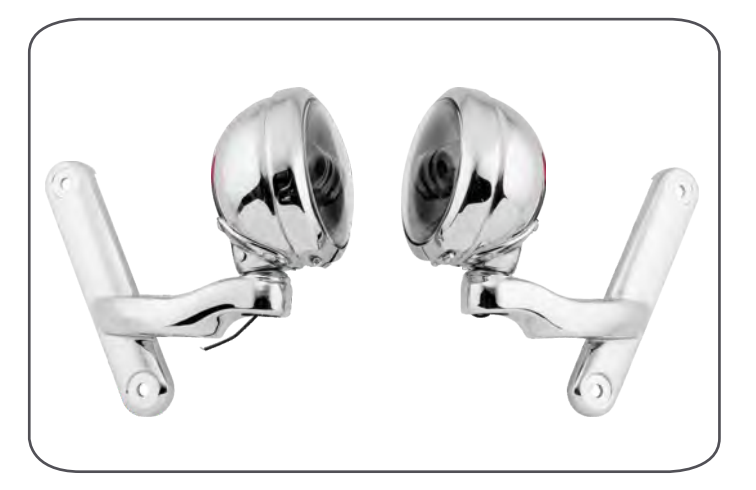
4.5" Black LED Auxiliary Fog/Passing Lights w/ Chrome Bucket and mounting bracket, fits most 1997-Up HD Glide Models. (pair)