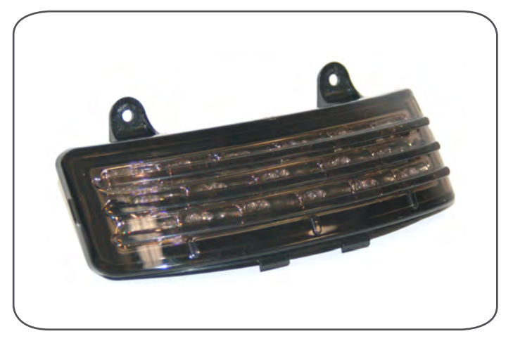
Tri-Bar Fender Tip LED Light with optional/intergrated turn signals, SMOKE LENS Fits: '06-'09 Street Glide® and Road Glide® Models. (Separate turn signal wiring required.)