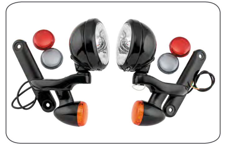
4.5" Chrome LED Auxiliary Fog/Passing Lights w/bullet LED turn signals, choice of lenses, Black Bucket and mounting bracket, fits most 1997-Up HD Glide Models. (pair)