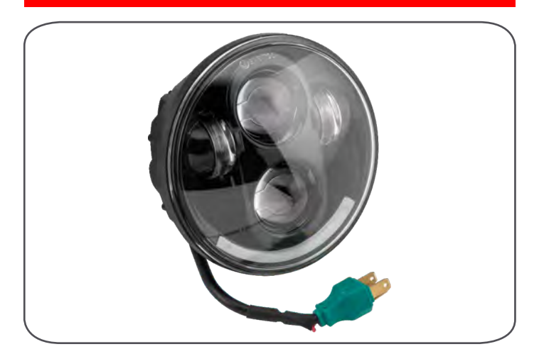
5.75" LED Black Premium Headlamp, 100% Plug-n-Play. (Fits most 5.75" headlight buckets)