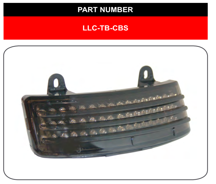
Tri-Bar Fender Tip LED Running & Brake Light, SMOKE LENS Fits: '14-'Up Street and Road Glide Models. 100% Plug-n-Play!