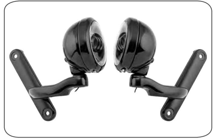
4.5" Black LED Auxiliary Fog/Passing Lights w/ Black Bucket and mounting bracket, fits most 1997-Up HD Glide Models. (pair)