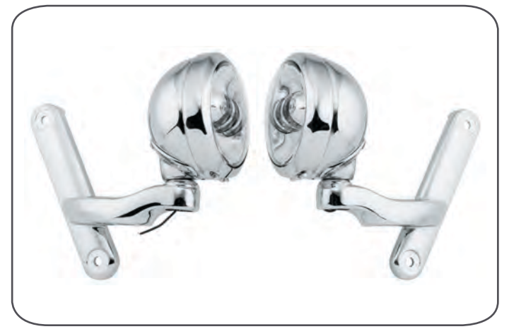
4.5" Chrome LED Auxiliary Fog/Passing Lights w/Chrome Bucket and mounting bracket, fits most 1997-Up HD Glide Models. (pair)