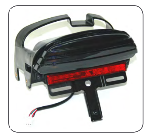
Dyna® Replacement LED Taillight, SMOKE LENS Fits: '08-'13 Dyna Fat Bob FXDF models. (with optional/integrated turn signals)