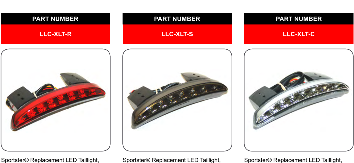
Sportster® Replacement LED Taillight, RED LENS Fits: Roadster, Forty-Eight, Iron, 883L, 1200L, 883N, 1200N & 1200V Models.

Sportster® Replacement LED Taillight, SMOKE LENS Fits: Roadster, Forty-Eight, Iron, 883L, 1200L, 883N, 1200N & 1200V Models.