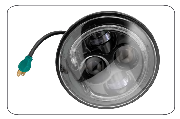
7" LED Black Halo Style Headlamp, 100% Plug-n-Play, includes mounting adapter!