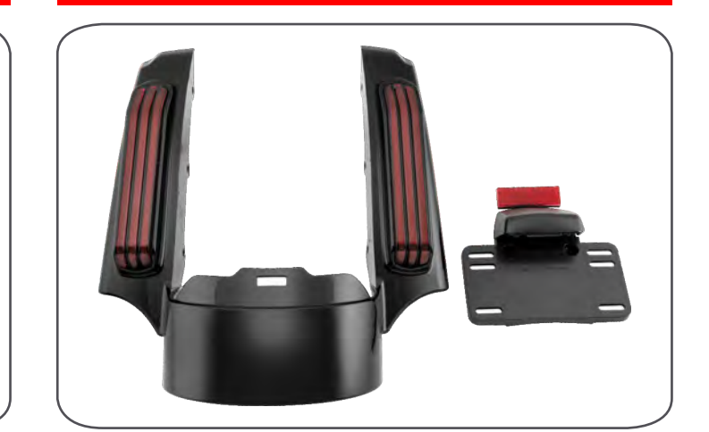
Black (paint-ready) Rear Fender Fascia Kit with Turn Signals & Wiring Harness, Fits: 2014-Up Street Glide® and Road Glide® Models. Red lenses with Red LED's.