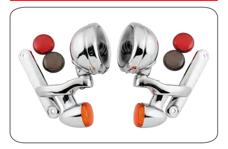
4.5" Black LED Auxiliary Fog/Passing Lights w/bullet LED turn signals, choice of lenses, Chrome Bucket and mounting bracket, fits most 1997-Up HD Glide Models. (pair)