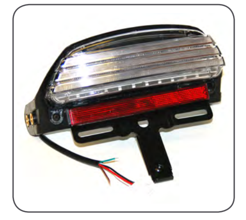
Softail® Replacement LED Taillight, CLEAR LENS Fits: '06-later FXST, FXSTB, FXSTC, FXSTS and FLSTSB models. (with optional/integrated turn signals)