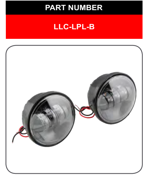
4.5" Black LED Auxiliary Fog/Passing Lights. (pair) (includes pigtail for Plug-n-Play universal fitment, 1997-Up)