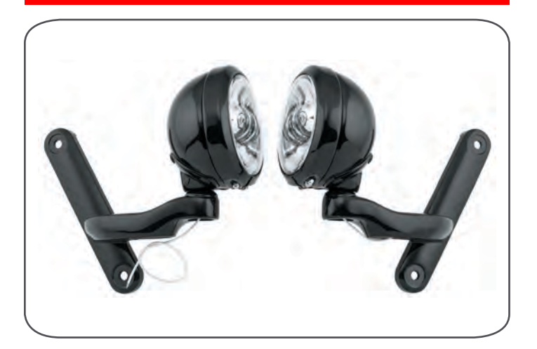
4.5" Chrome LED Auxiliary Fog/Passing Lights w/ Black Bucket and mounting bracket, fits most 1997-Up HD Glide Models. (pair)