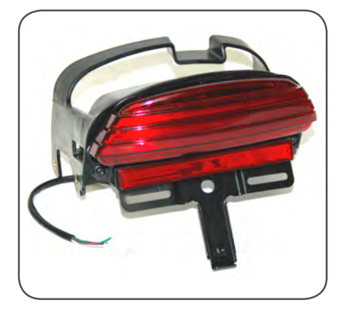
Dyna® Replacement LED Taillight, RED LENS Fits: '08-'13 Dyna Fat Bob FXDF models. (with optional/integrated turn signals)