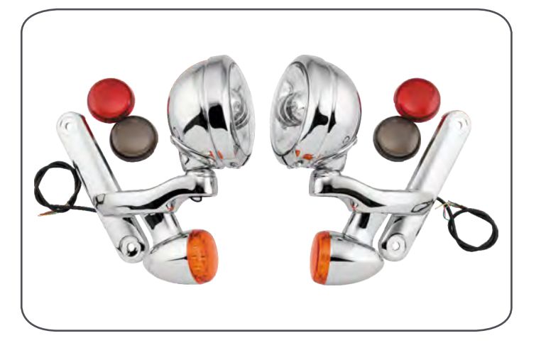
4.5" Chrome LED Auxiliary Fog/Passing Lights w/bullet LED turn signals, choice of lenses, Chrome Bucket and mounting bracket, fits most 1997-Up HD Glide Models. (pair)