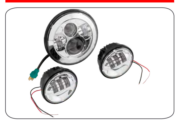
7" LED Chrome Lamp, Premium Headlamp w/ (2) 4.5" Chrome Fog/Passing Lamps, 100% Plug-n-Play, includes mounting adapter!