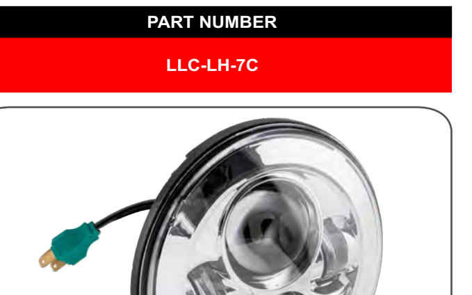
7" LED Chrome Premium Headlamp, 100% Plug-n-Play, includes mounting adapter!