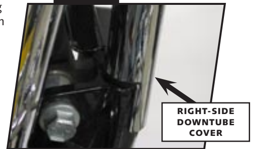
RIGHT-SIDE DOWNTUBE COVER