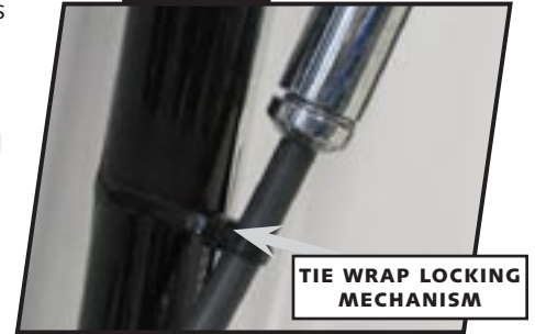
TIE WRAP LOCKING MECHANISM