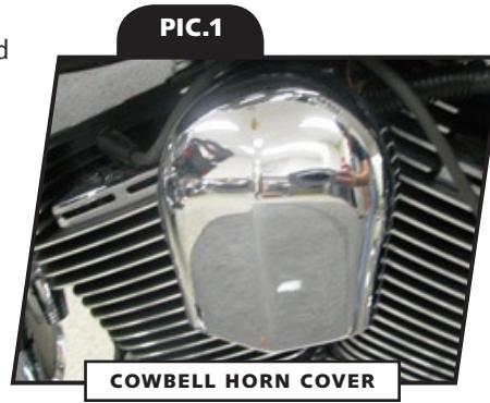
COWBELL HORN COVER

STEP 4 Remove the backing from the adhesive tape and press and hold the cover in place for one (1) minute. Full bonding strength will occur in 24 hours.