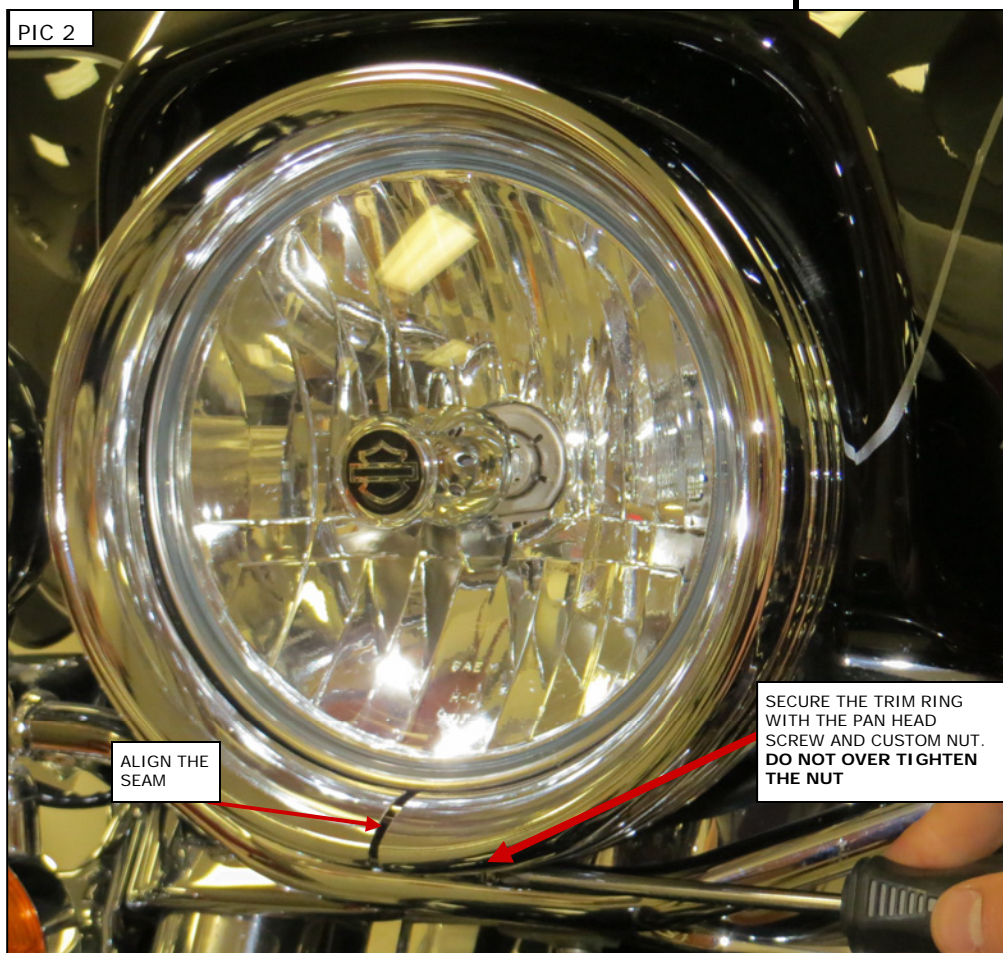
PIC 2 ALIGN THE SEAM