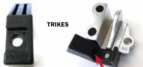
TALL EDGE AGAINST MOUNT PIC 6