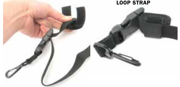
OFF-BIKE VIEW OF STRAPS