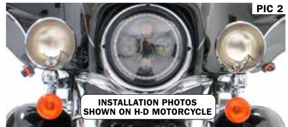
INSTALLATION PHOTOS SHOWN ON H-D MOTORCYCLE