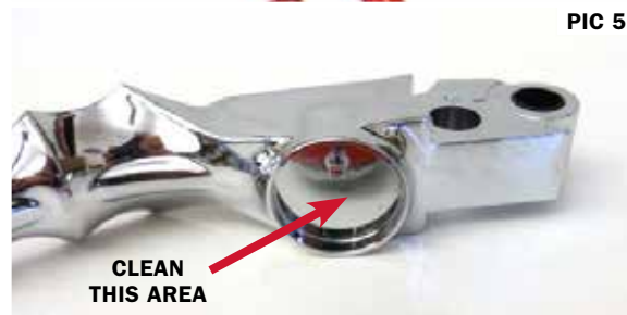
CLEAN THIS AREA