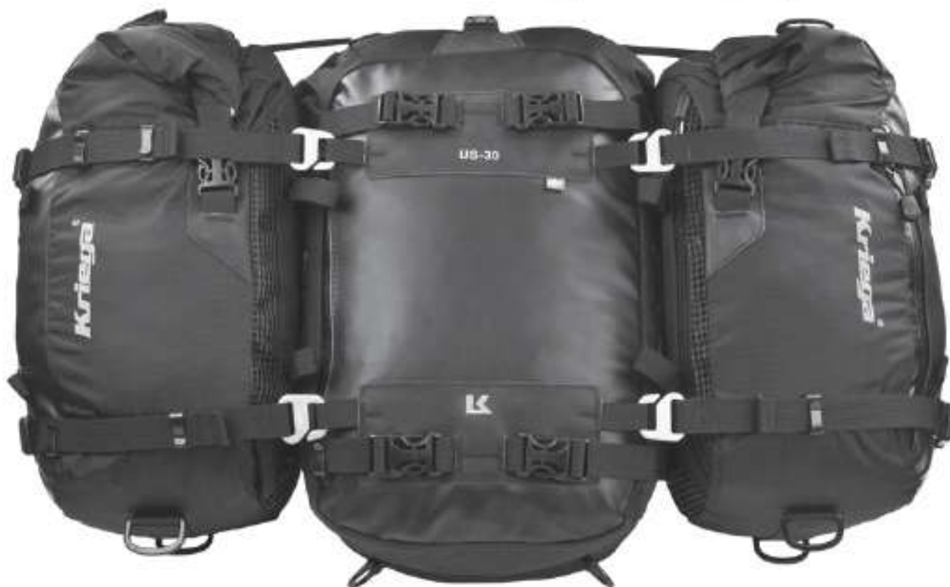
70 litres US30+(2 x US20)