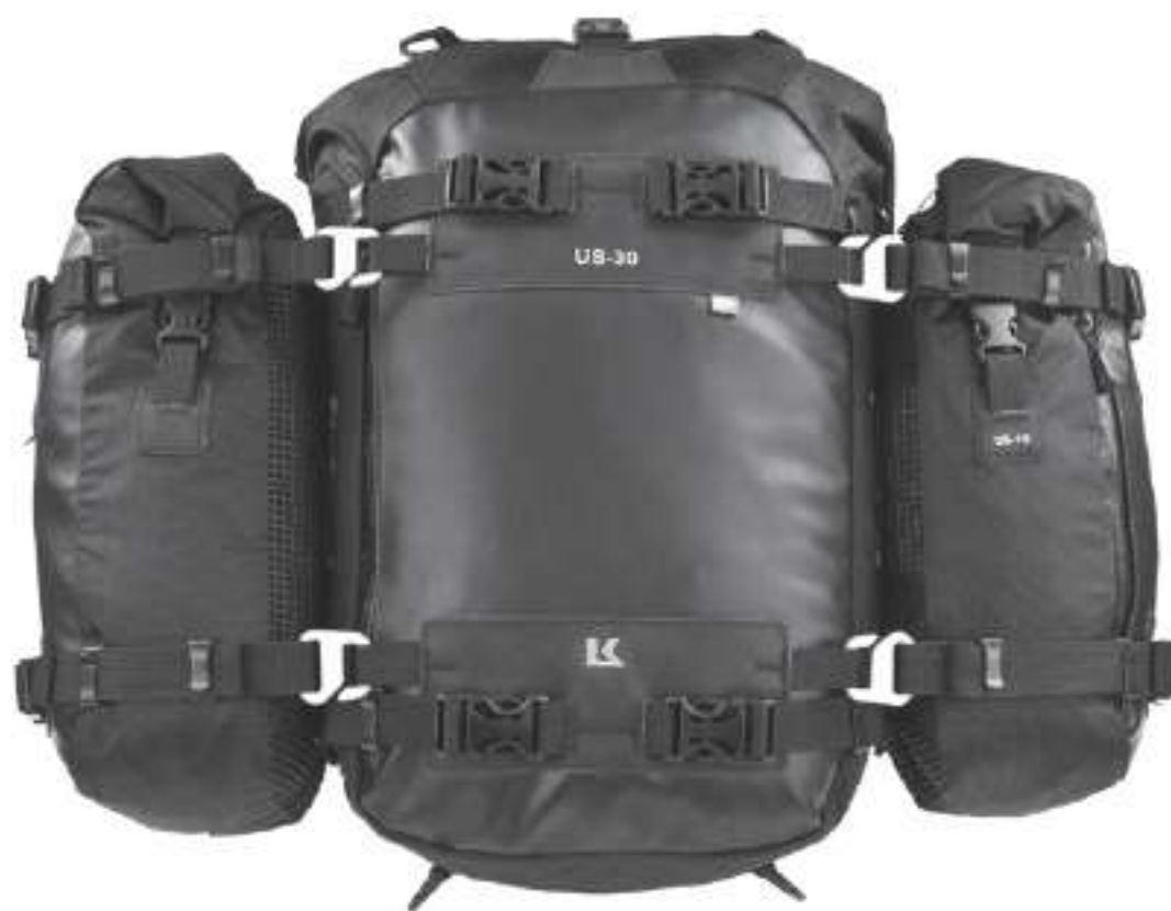
50 litres US30+(2 x US10)