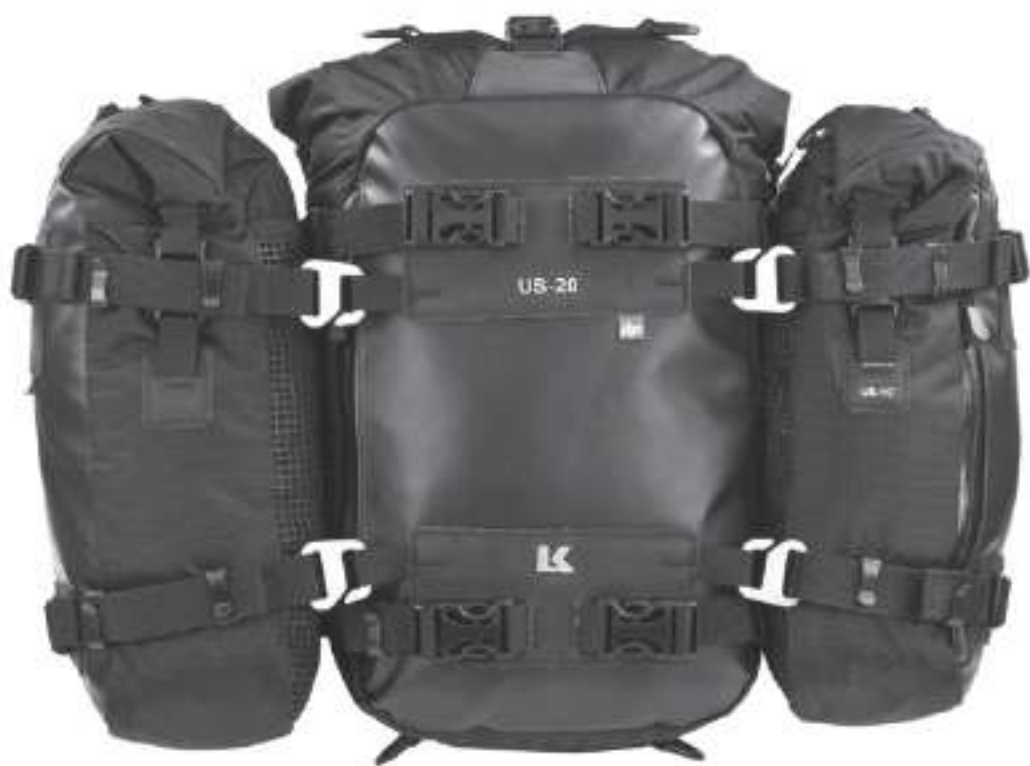
40 litres US20 + (2 x US10)