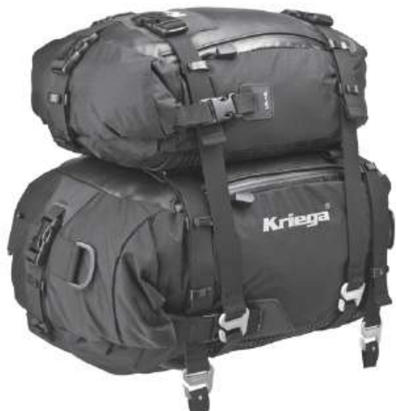
30 litres US20+US10