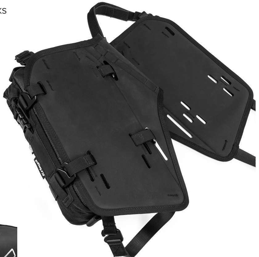
EXAMPLE OS-6 FITTING