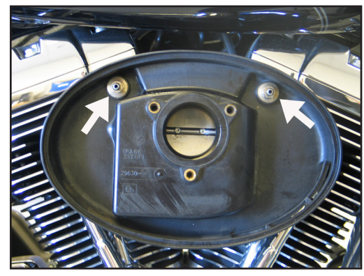
5. Remove the two breather / air filter base mounting bolts shown.

NOTE: K&N Engineering, Inc. recommends that customers do not discard the factory air intake components.