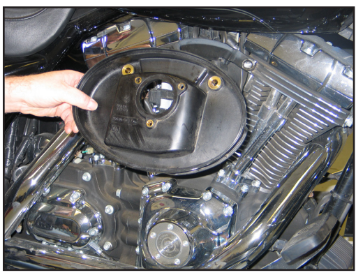
6. Remove the air filter base from the vehicle as shown.

NOTE: K&N Engineering, Inc. recommends that customers do not discard the factory air intake components.