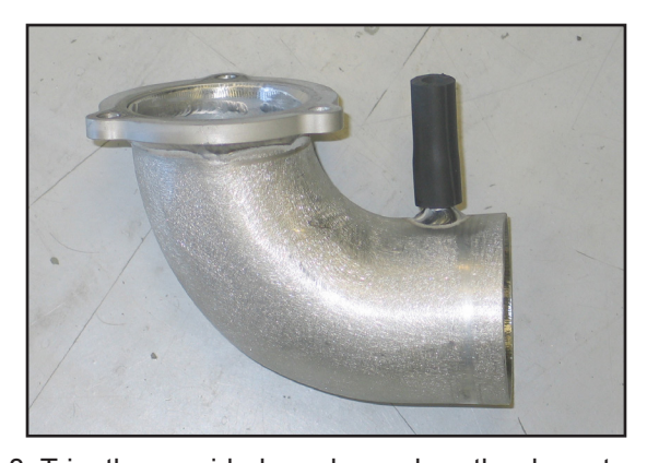
8. Trim the provided crankcase breather hose to a length of 1.5" and then install it onto the K&N ^{\odot} intake tube as shown.