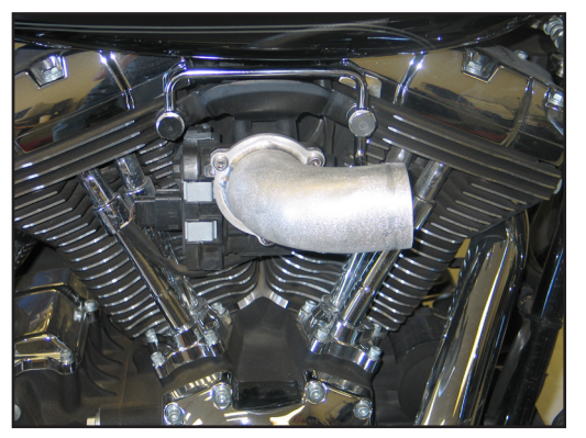
9. Install the K&N® intake tube onto the throttle body along with the provided gasket and secure with the provided mounting bolts.

NOTE: Apply a drop of the provided thread locker to the threads of the intake tube mounting bolts.