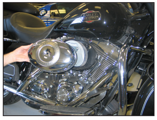
2. Remove the air filter cover bolt and air filter cover as shown.

1. Turn off the ignition and disconnect the negative battery cable.