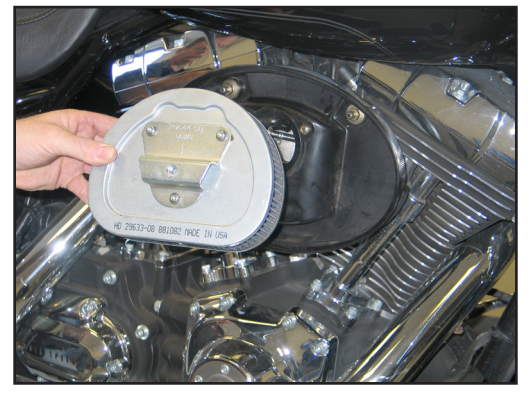
4. Remove the air filter from the vehicle and disconnect the crankcase breather tubes.