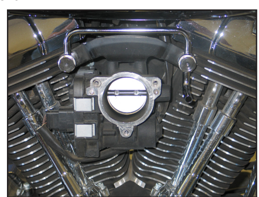
7. Install the supplied crankcase breather tube using the provided breather bolts and washers. NOTE: Place one washer on each side of the of the breather tube.