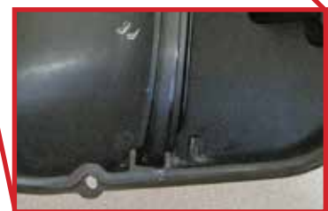
detail of sealing groove