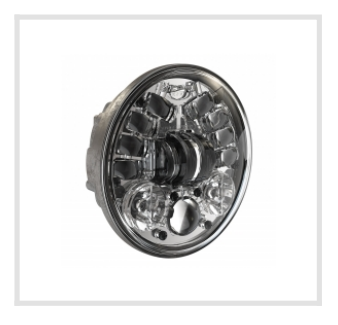
Part Number 0551731

12V SAE/ECE LED High & Low Beam Headlight with Chrome Inner Bezel