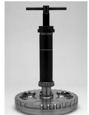
TIMKEN FIGURE 3