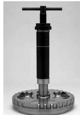
RACE FIGURE 2