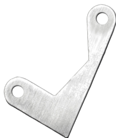
4600AR-C Jagg anti-rotation device