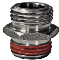
Stock-to-Jagg oil filter nipple

ley-Davidson oil cooling system, uninstall the stock oil filter adapter by removing the flanged oil filter nipple that holds the adapter in place using a 7/16" Allen wrench. Locate the stock-to-Jagg oil filter nipple (shown at right) included in the kit. Install by inserting the orange-painted end into the port where the stock oil filter stem was removed. Using a 7/8" socket, tighten until the hex is flush against the oil filter housing.