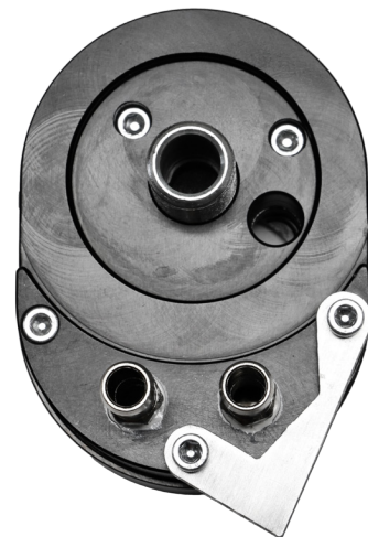
Anti-rotation device fitment

NOTE: On rubber-mounted engine models, allow adequate clearance to ensure that the adapter will not strike any object when the motor shakes.