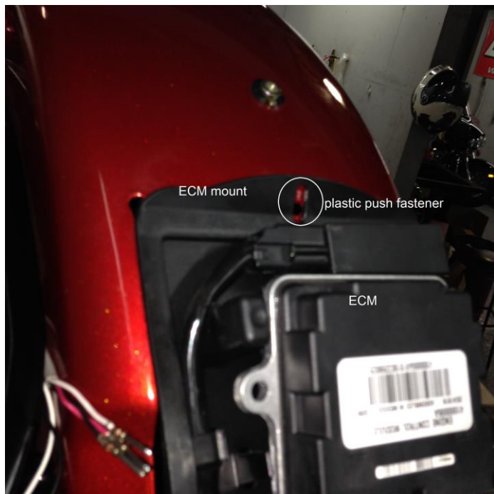
ECM Mount at fender and Push Button Fastener