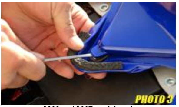
2006 and 2007 models only

3. For 2006 & 2007 models, pry up the center tab. ( photo 3 ) Be careful not to break the tab.