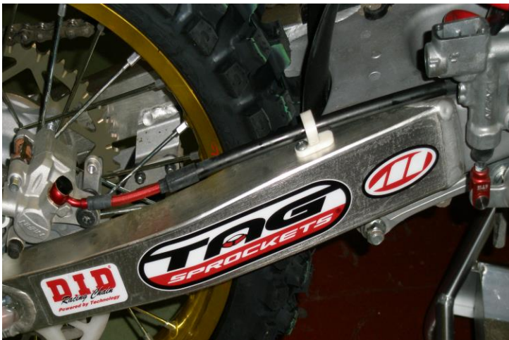
C. Line routed down the swing arm to caliper