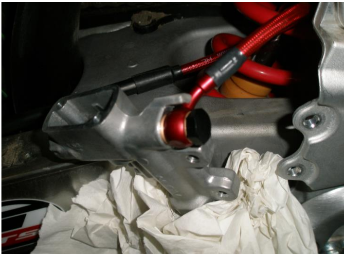
A. Rear Master Cylinder (removed from frame)

get used to the new brake lever pressure and feel. We recommend checking your brake system periodically; be sure to check that your bolts are tight and VERY carefully check your line for any leaks or damage. If there are any signs of damage or stress to the lines, the complete brake line kit will need to be replaced.