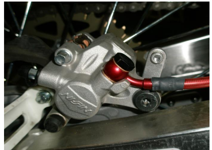
D. Rear Caliper