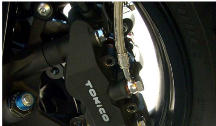
e. Left caliper