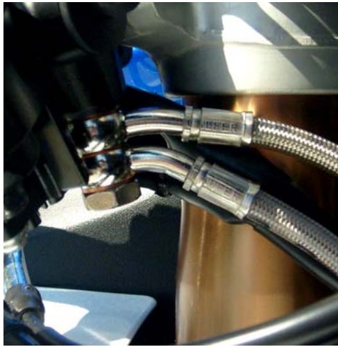
a. Front master cylinder, notice position of fittings

Please be aware that the overall braking feel has been changed dramatically. We suggest taking it easy while you get used to the new brake lever pressure and feel. We recommend checking your brake system periodically; be sure to check that your bolts are tight and VERY carefully check your lines for any leaks or damage. If there are any signs of damage or stress to the lines, the complete brake line kit will need to be replaced. Remember, our brake lines have a LIFETIME WARRANTY!