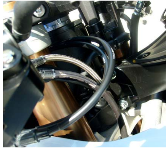
b. Routing from master cylinder