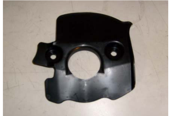
d. Plastic shield removed