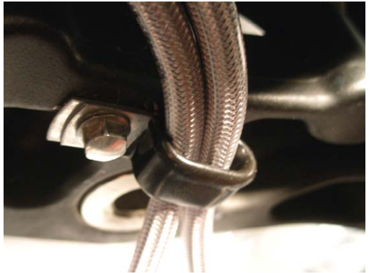
B. Galfer C-Clip at the Lower Triple Tree