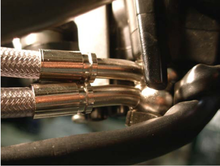
A. Front Master Cylinder