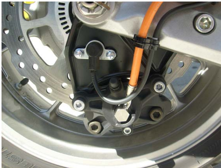
c. Rear caliper