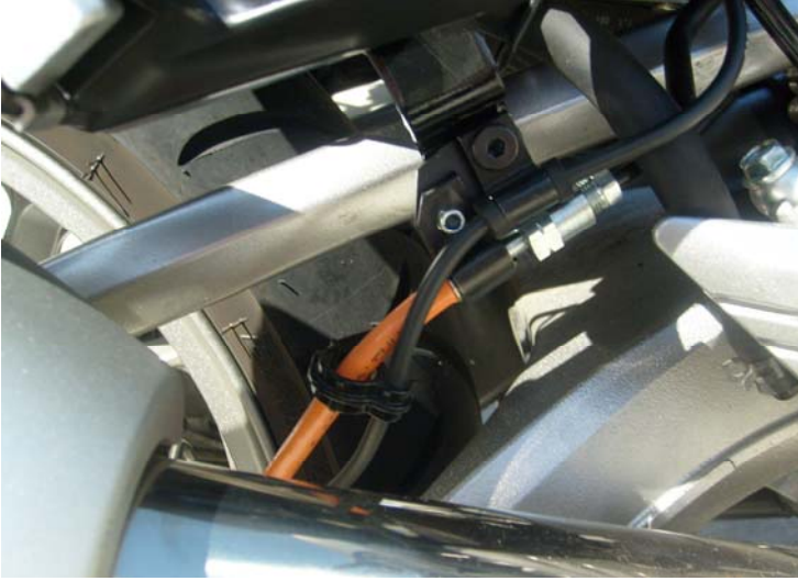
a. Galfer sheath clamp assembly