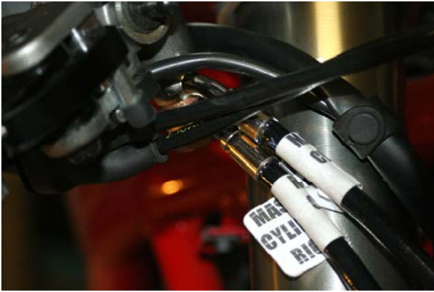
a. Front master cylinder