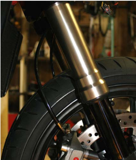
c. Right caliper, routing behind forks