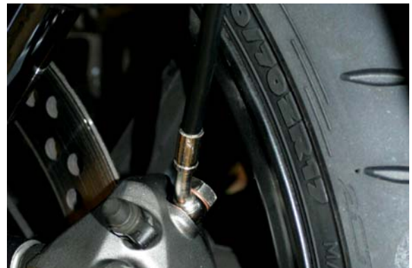
f. Left caliper