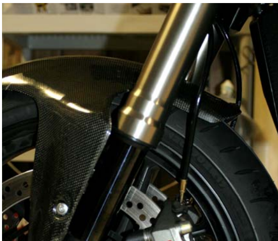
e. Left caliper, routing behind forks