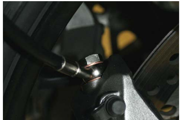
d. Right caliper