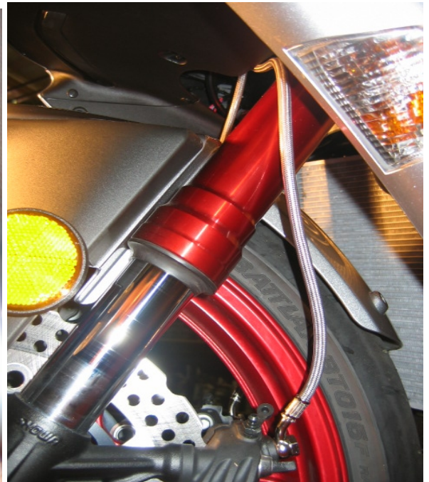
Right Caliper view.

Discover other motorcycle brake parts on our website.