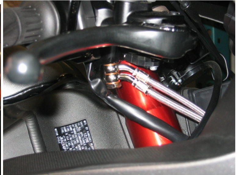
Master Cylinder view, 2 lines down.