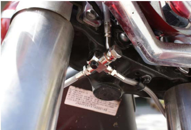
c. Lines A, B & C – T-block and Galfer c-clip at the lower triple tree