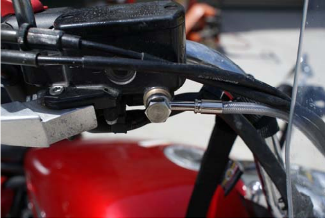
a. Line A – Front master cylinder

Please be aware that the overall braking feel has been changed dramatically. We suggest taking it easy while you get used to the new brake lever pressure and feel. We recommend checking your brake system periodically; be sure to check that your bolts are tight and VERY carefully check your lines for any leaks or damage. If there are any signs of damage or stress to the lines, the complete brake line kit will need to be replaced. Remember, our brake lines have a LIFETIME WARRANTY!