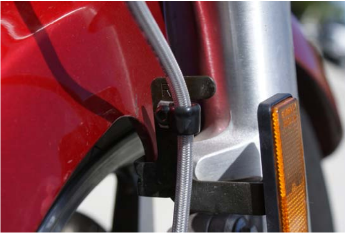
e. Line B – Galfer c-clip at fender