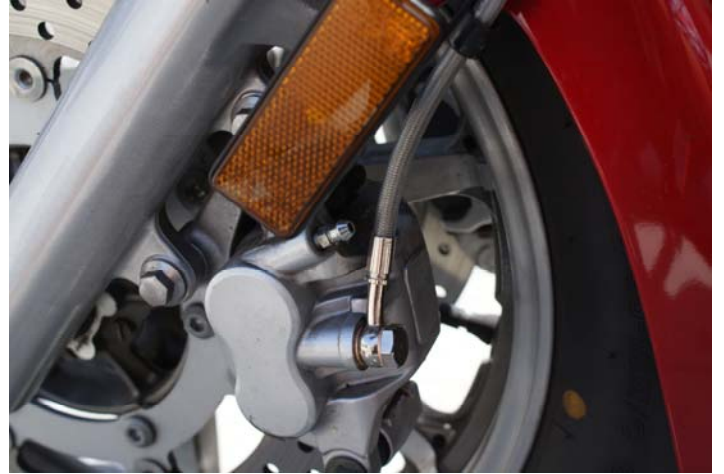
f. Line C – Left caliper