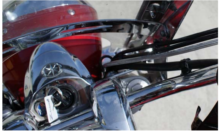
b. Line A – Front MC routing