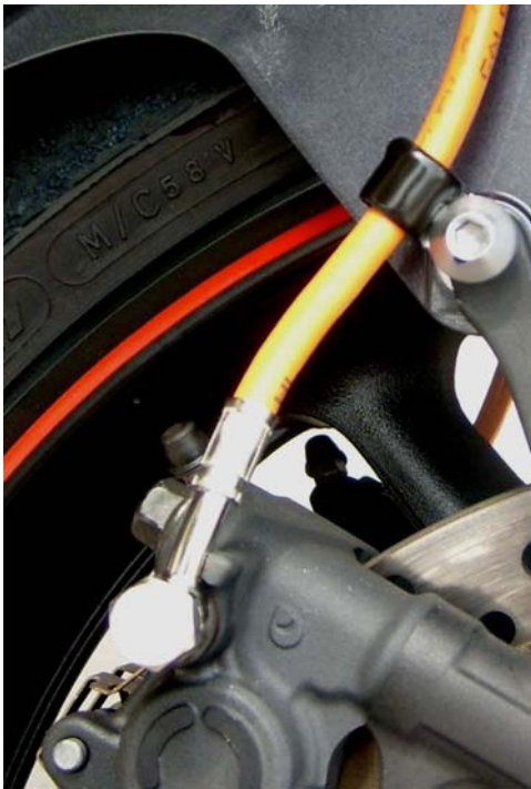
c. Right caliper