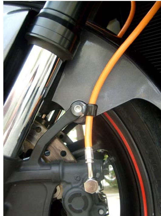
d. Left caliper

Learn more about motorcycle brake parts we have.