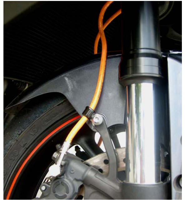
b. Right caliper, lines routed behind forks and Galfer c-clip at fender