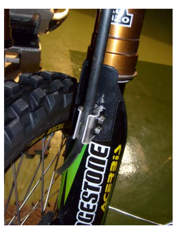
C. Stock Line Holder at Fork