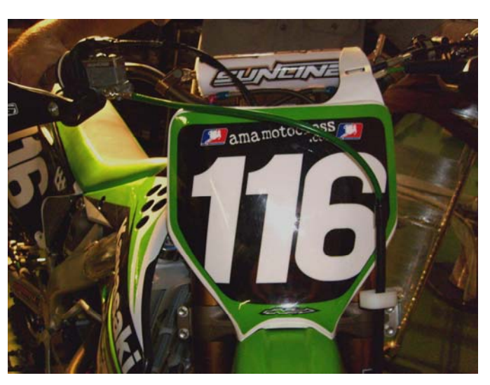
B. Number Plate/ Stock Line Holder