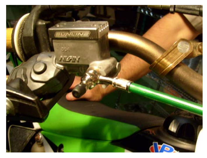
A. Master Cylinder (with optional Galfer bleeder bolt)