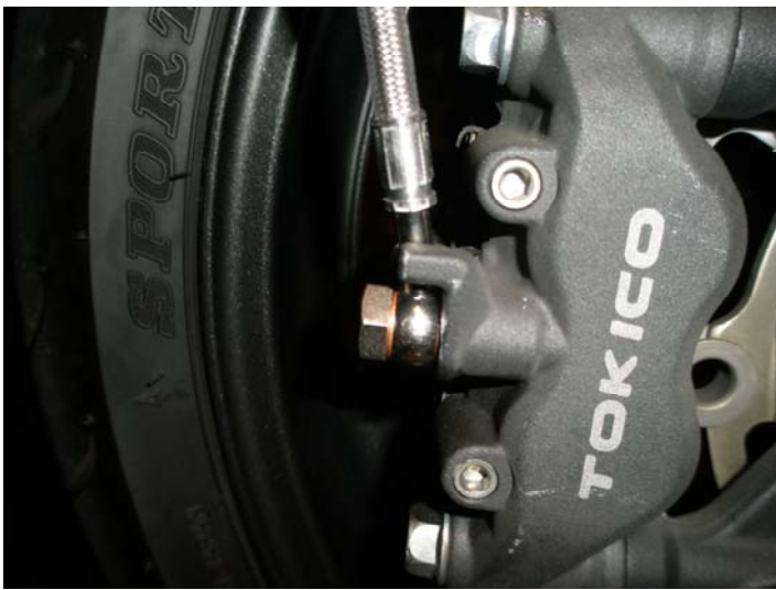
C. Right Caliper