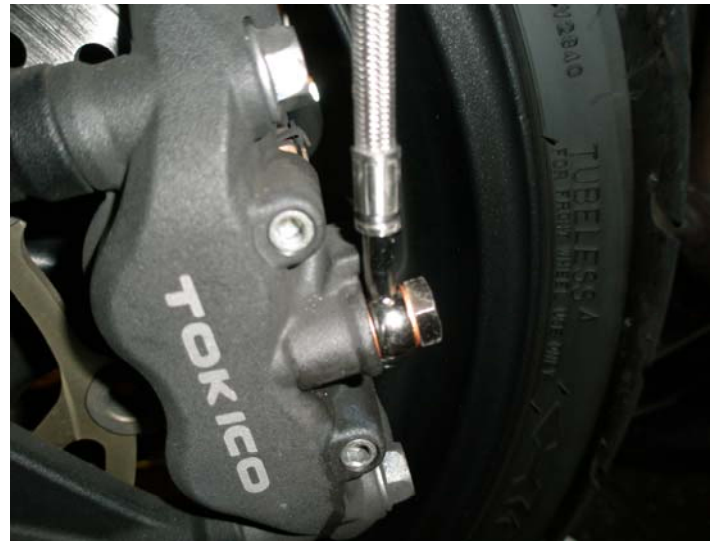
D. Left Caliper