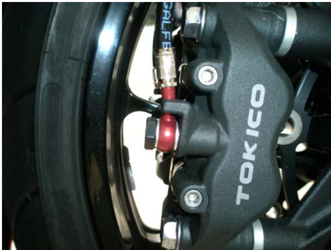
g. Right caliper, notice sequence