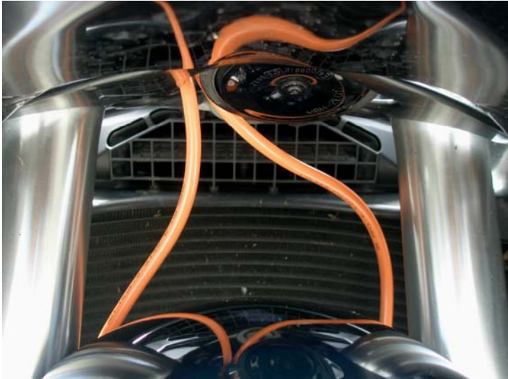
e. Routing behind forks