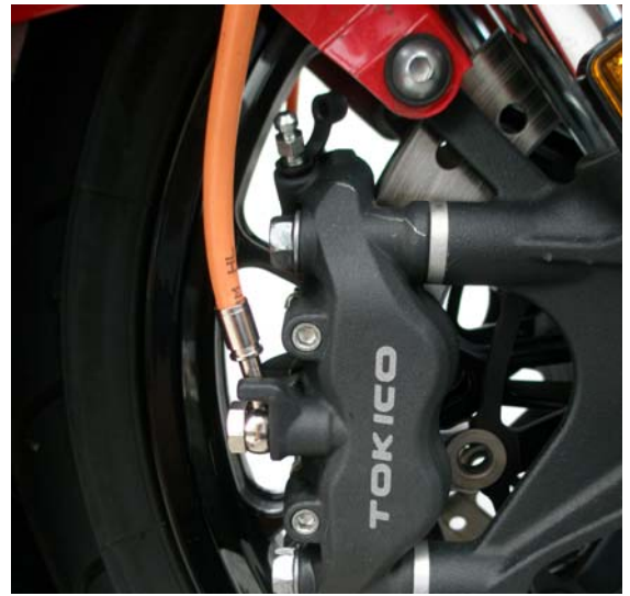
f. Right caliper