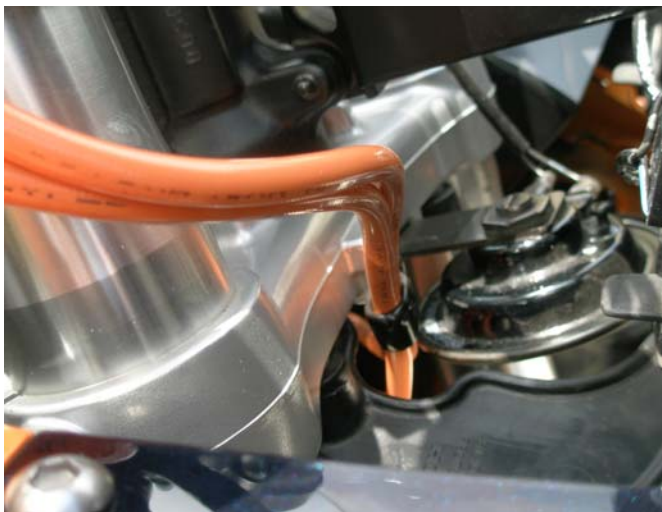
c. Routing at lower triple tree