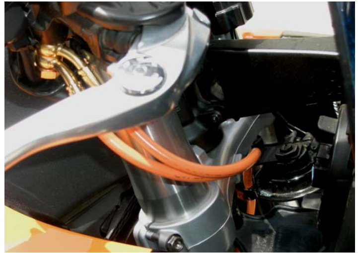
b. Routing from master cylinder to lower triple tree