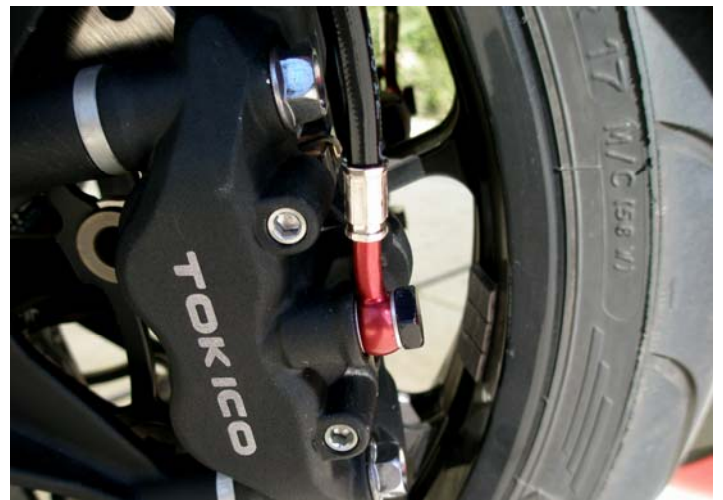
h. Left caliper, notice sequence