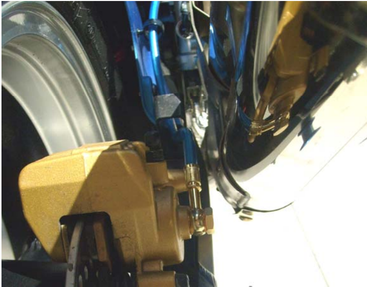
c. Rear line routing