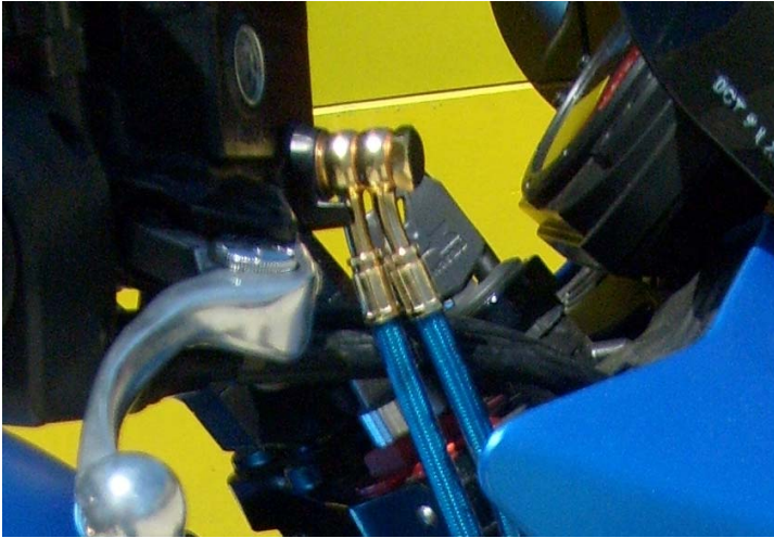
a. Front master cylinder