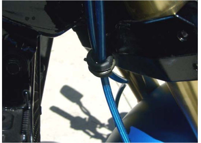
b. OEM line holder at lower triple tree