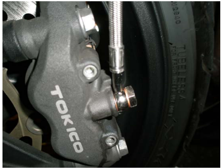
D. Left Caliper

Learn more about motorcycle brake parts we have.