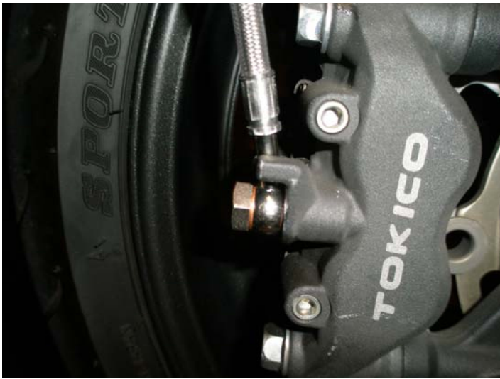
C. Right Caliper