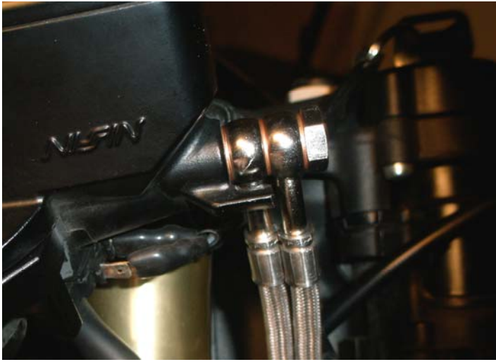
A. Front Master Cylinder