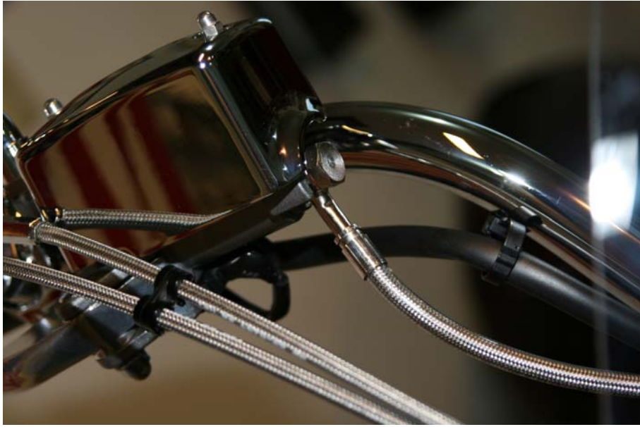
A. Master Cylinder