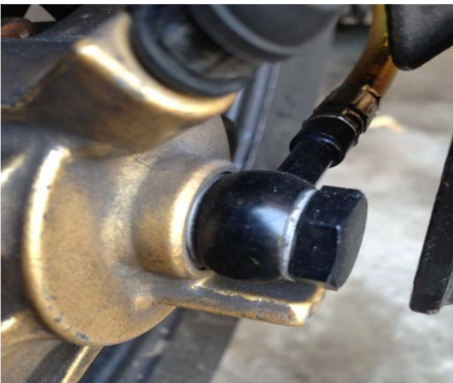
C. Rear Caliper