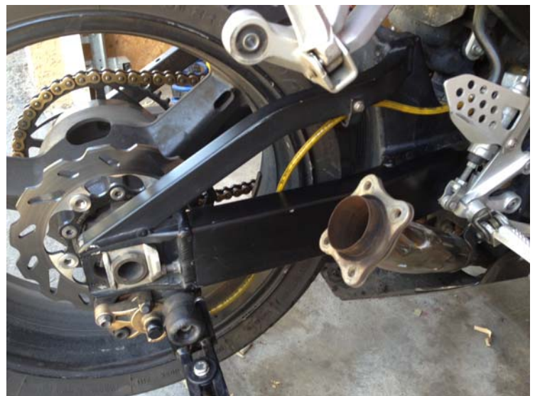
D. Overall Line Routing