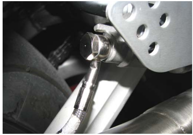
b. Galfer at the rear master cylinder