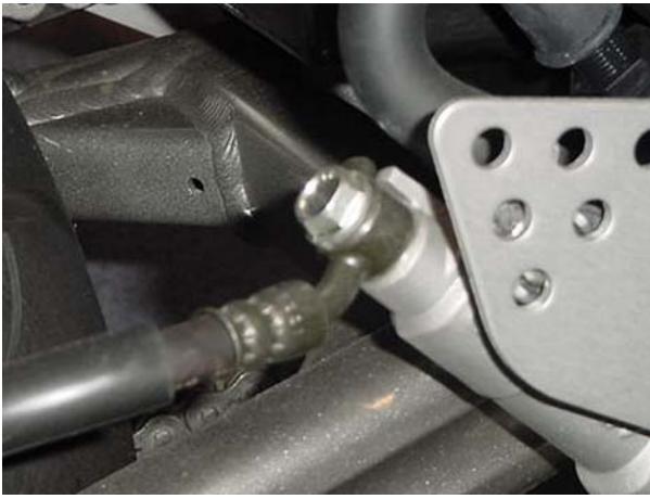
a. OEM at the rear master cylinder