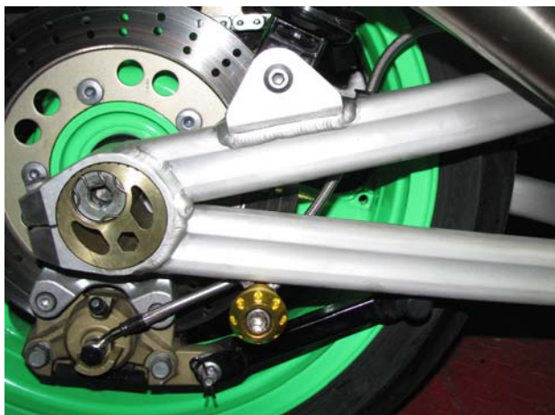
e. Rear overall