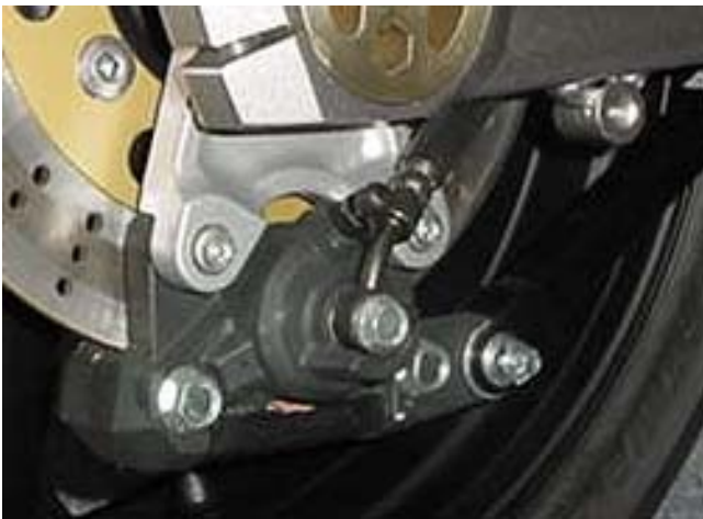
c. OEM at the rear caliper