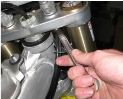
Figure 1: UNDERBAR MOUNT ONLY