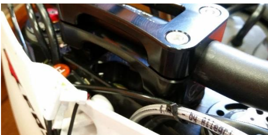
Figure 2. Depicts the Fastway handlebar clamp installed.

Note: Some reference pictures are taken during initial prototyping and may not reflect the final color of certain components