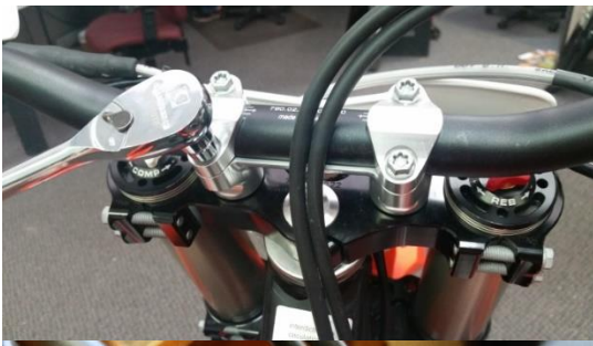
Figure 1. Depicts the stock handlebar riser and top clamp assembly.