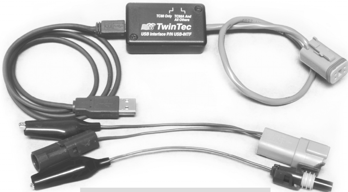
Figure 1 – Twin Tec USB Interface with Adapters

NOTE: You must set the switch to the correct position. Use the TC88 setting for TC88 ignitions with two 12 pin Deutsch connectors only. Use the TC88A setting for all other Twin Tec engine control modules and the Twin Tuner series.