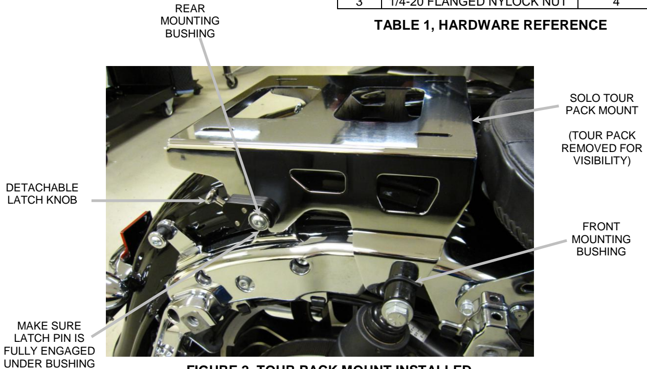
FIGURE 2, TOUR PACK MOUNT INSTALLED

*** DO NOT *** EXCEED THE MAXIMUM WEIGHT CAPACITY OF THE TOUR PACK MOUNT, MAX. WEIGHT CAPACITY INCLUDES TOUR PACK AND CONTENTS = 25 POUNDS.