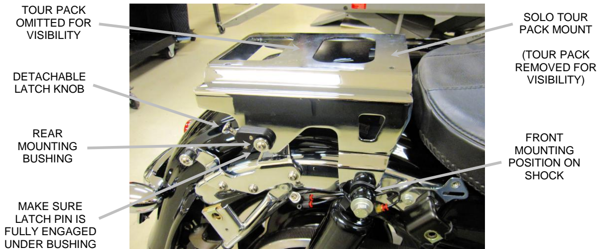
FIGURE 3, TOUR PACK MOUNT INSTALLED

*** DO NOT *** EXCEED THE MAXIMUM WEIGHT CAPACITY OF THE TOUR PACK MOUNT, MAX. WEIGHT CAPACITY INCLUDES TOUR PACK AND CONTENTS = 25 POUNDS.