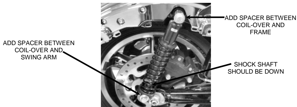
FIGURE 1 ONLY FOR MODELS EQUIPPED WITH COIL-OVER SHOCKS

* Cobra® recommends you always wear a helmet while riding. Please never operate your motorcycle while under the influence of alcohol and/or drugs. Enjoy the new look of your motorcycle and please ride safely.