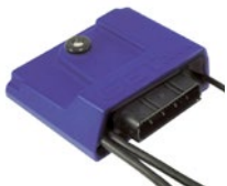
REPLACEMENT ECU RX1 BASIC 2016-17